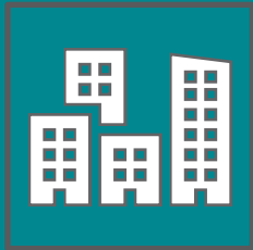
Scattered Sites/ Community Living Placement